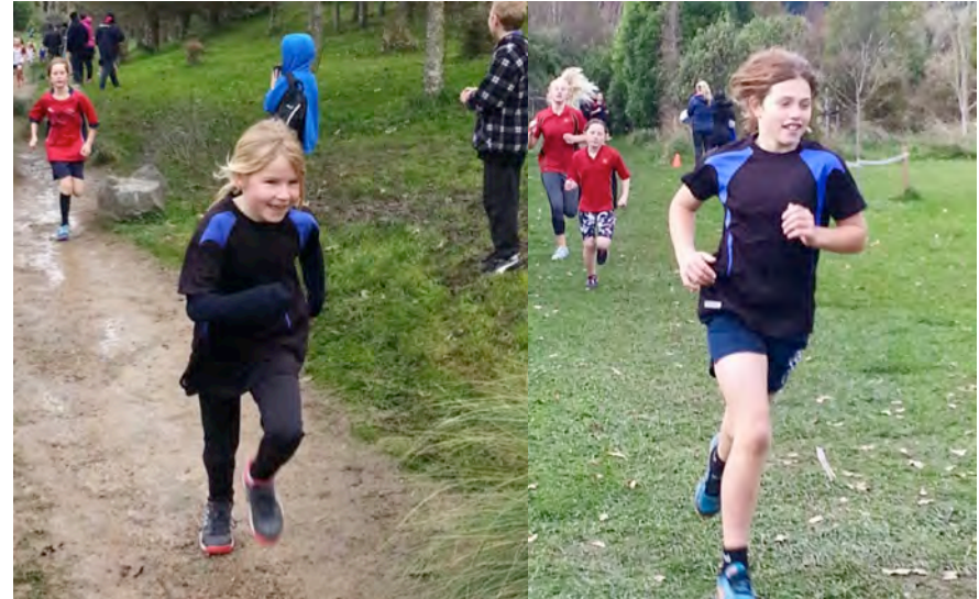
Lincoln Zone Cross Country on Thursday this week