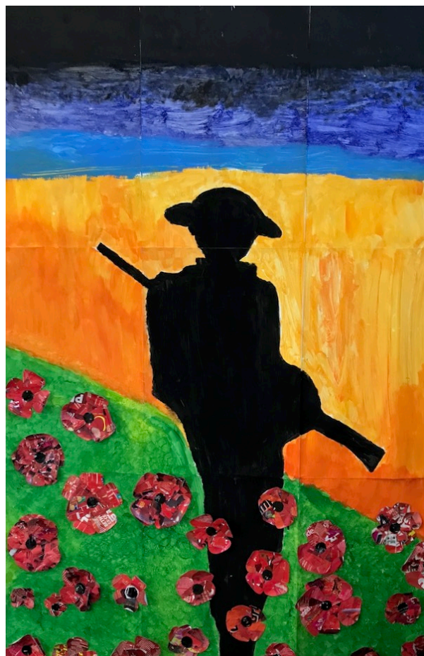
ANZAC artwork by Kahikatea students.

Duvauchelle School will have a food stall with food and drinks available to purchase.